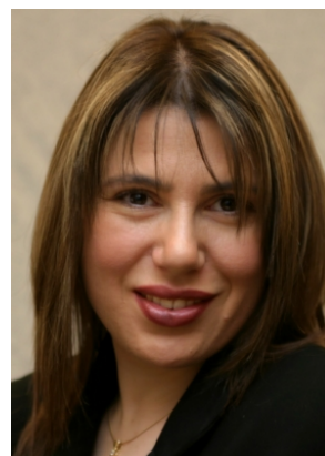
FIDE Trainers Committee member Grandmaster Susan Polgar: